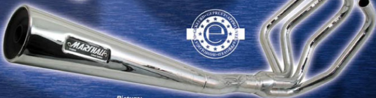
Picture: MARSHALL Deeptone 4 into 1 System